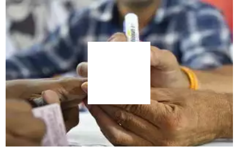
EC announces election dates for 5 poll-bound states, results on Dec 11

Big Change: The end of Five-Year Plans: All you need to know